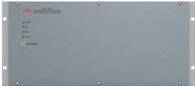
❖ Front Panel

PRRS-7973 multifunction fault recorder integrates multiple functions into one unit, providing transient recording, continuous disturbance recording, phasor measurements, power quality monitoring and sequence of event recording.